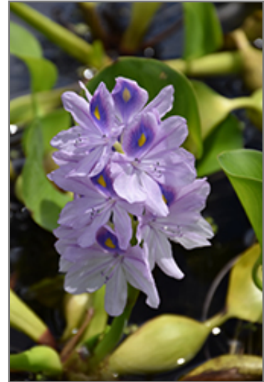
Water Hyacinth flowers