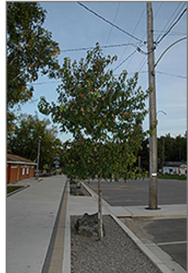
Amur Maple (tree form)