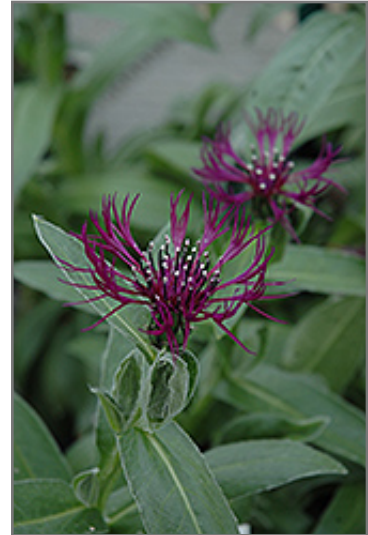
Amethyst Dream Cornflower flowers